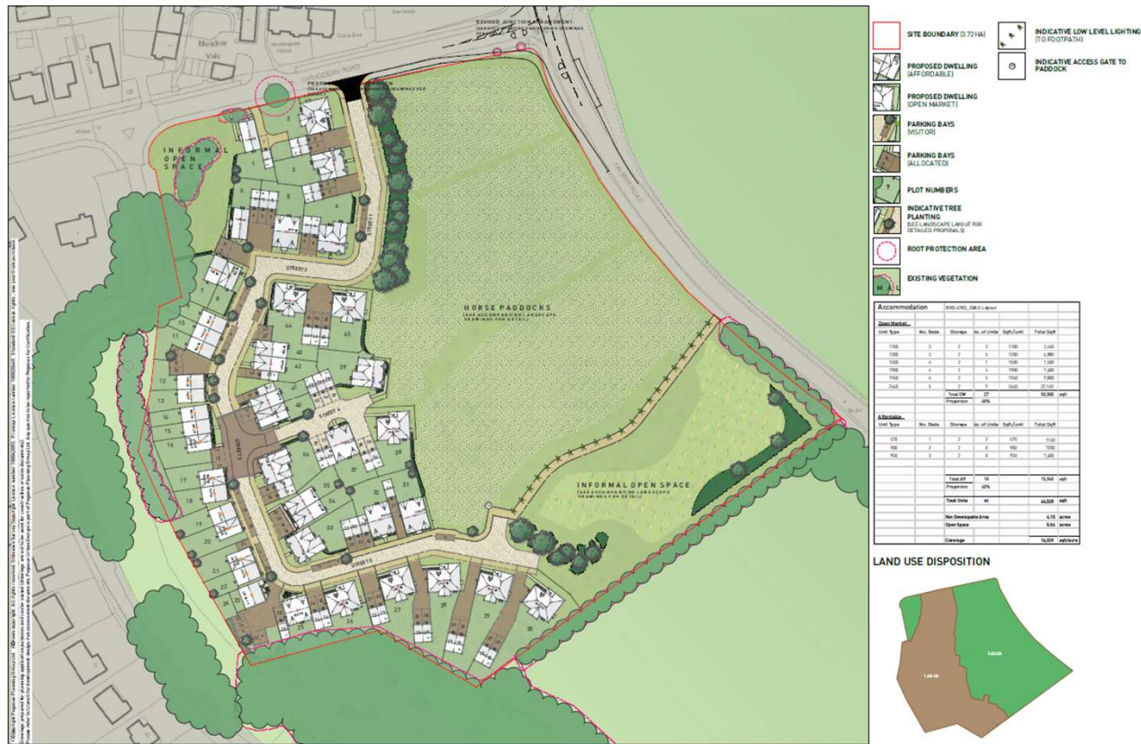
LAND SOUTH OF OIVINGDEAN ROAD, OIVINGDEAN, BRIGHTON - LAYOUT

T 01454 625945 | F 01454 618074 | www.pegasusp.co.uk | Team: DW/JA | Date: 20/03/2017 | Scale: 1:500 @ A1 | drwg: BRS.4783_20A0 | Client: LIGHTWOOD STRATEGIC